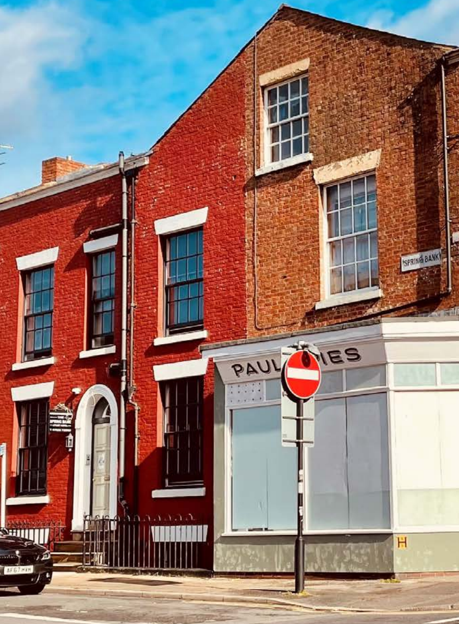
Fishergate Hill, Preston