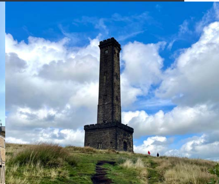
Peel Tower, Bury