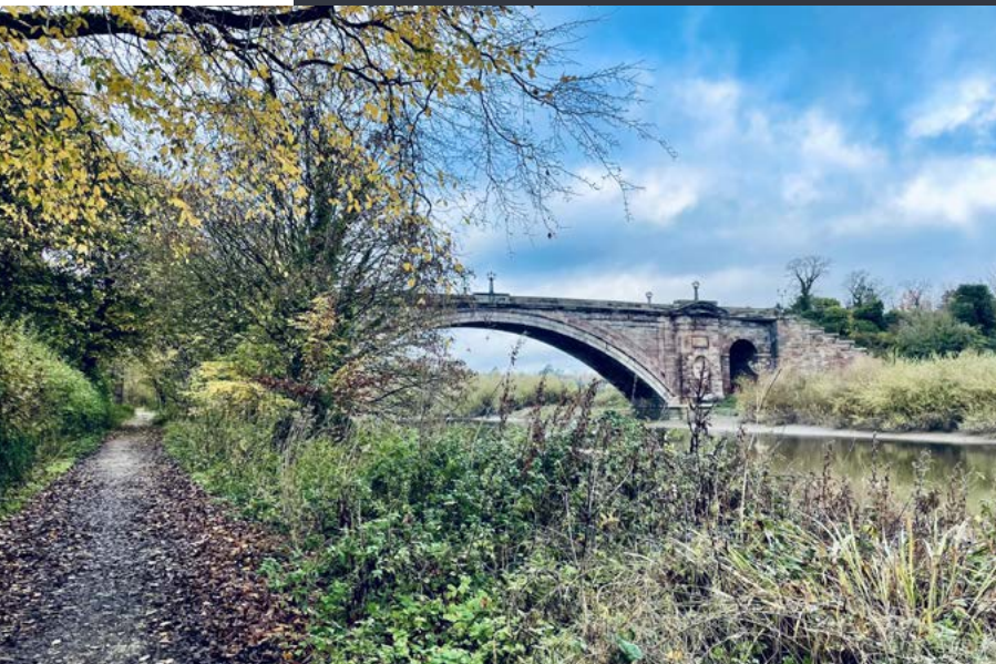
Curzon Park North, Chester

We were also appointed to produce a Heritage Statement to provide an understanding of the significance of the existing Grade II listed building and its value to the historic setting within the wider context of Holcombe and Ramsbottom. This was to assist in the determination of a planning proposal for the installation of a web-cam style camera and flagpole on the building.