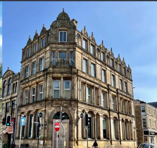
Imperial Chambers, Burnley